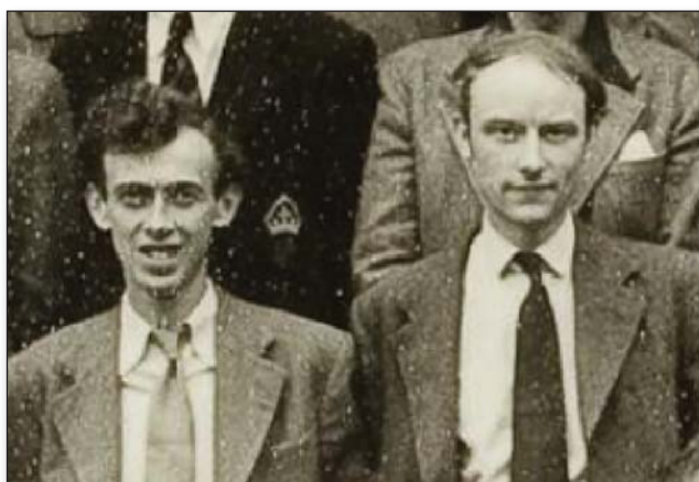
Fig. 1: Jim Watson (left) and Francis Crick (right). Detail of "Physics Research Students, Cavendish Laboratory," 1952, courtesy of Wellcome Library ( http://wellcomelibrary.org/ ), reference ID: PP/CRI/A/1/2/1, CC BY-NC 4.0.